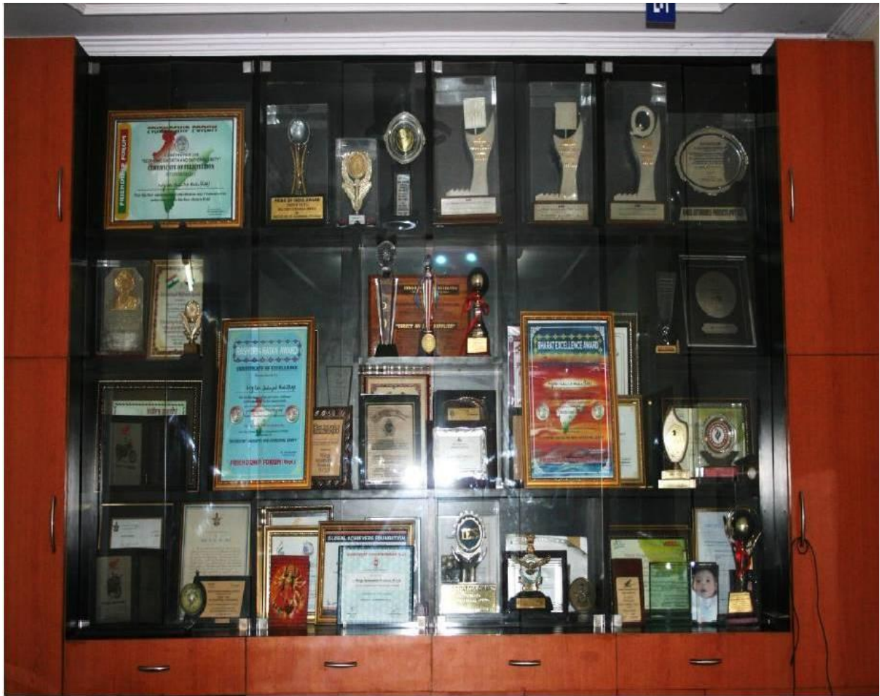
PHOTOGRAPHS OF AWARDS AND CERTIFICATES RECEIVED BY WINGS AUTOMOBILE PRODUCTS PVT LTD